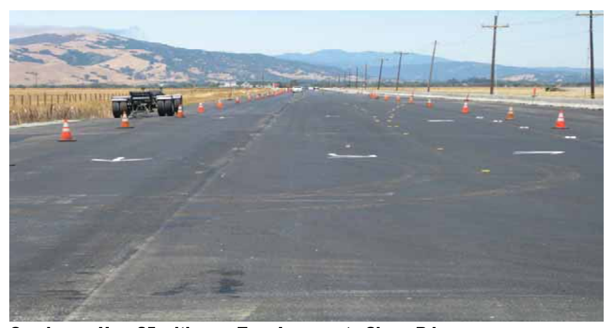
Overlay on Hwy 25 with new Turn Lane on to Shore Rd