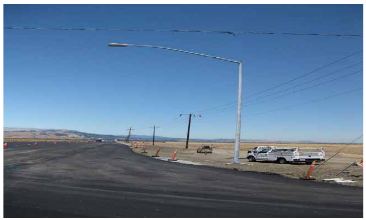
New Lighting at Shore Rd and Hwy 25