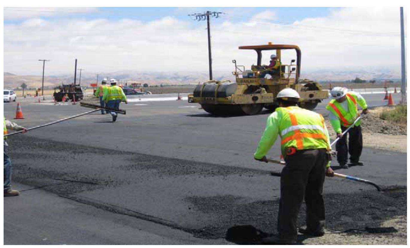
Shore Rd Intersection Overlay