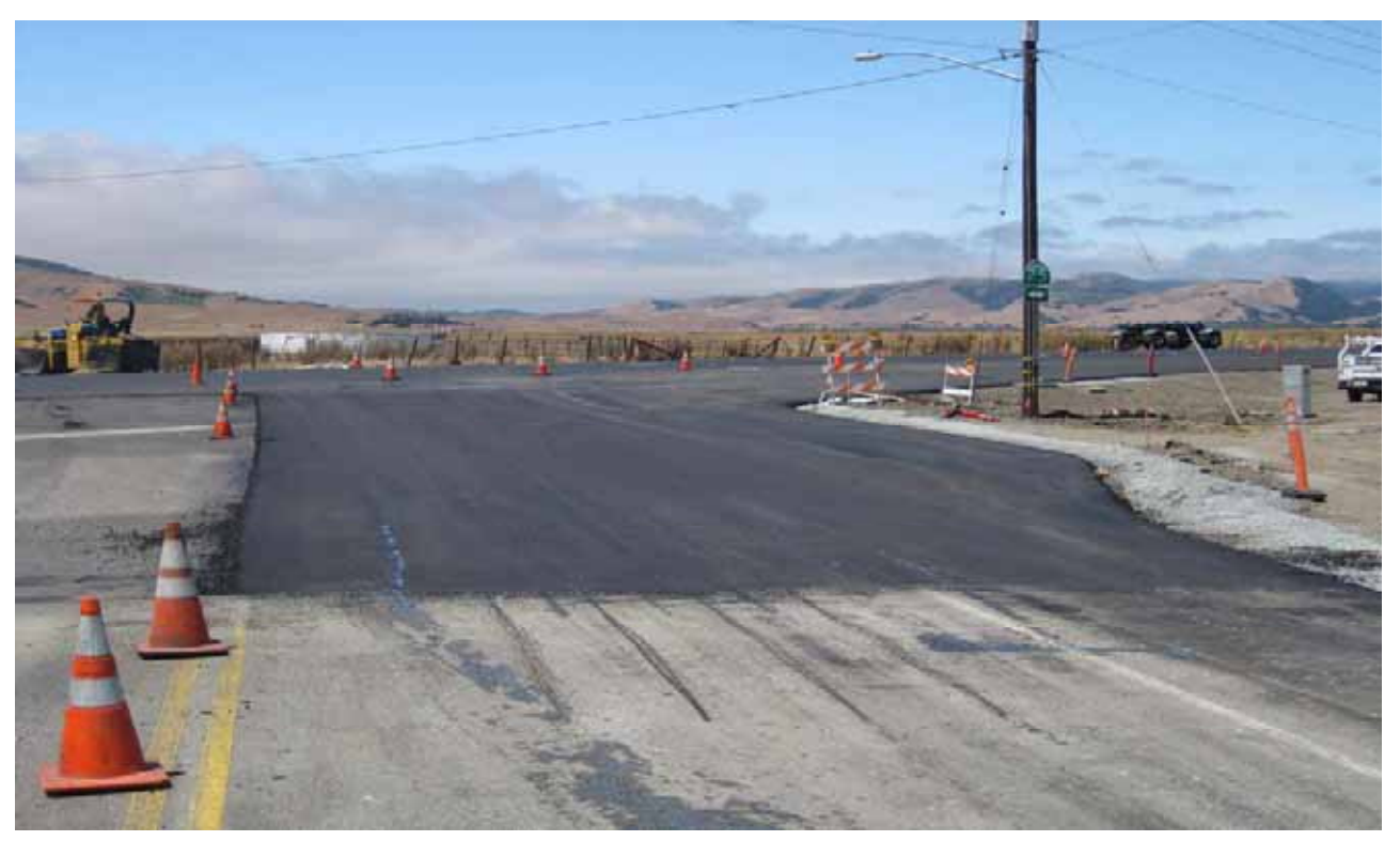
Overlay with Turn Lane to Hwy 25 Northbound