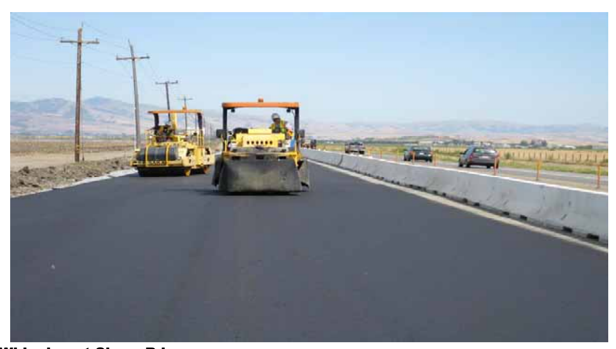
Widening at Shore Rd.